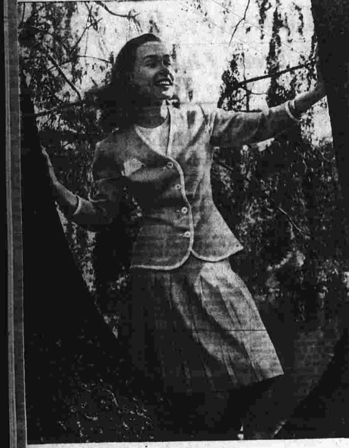
LUSCIOUS RABBIT HAIR JERSEY SUIT... Blazer Bound... With White Dickey Sweater, Aqua, Pink or Yellow in Sizes 9 to 15.

BURTONS... FOR BEST 841 MAIN ST. MANCHESTER A NEW FASHION EXCLUSIVE... BY PETTI